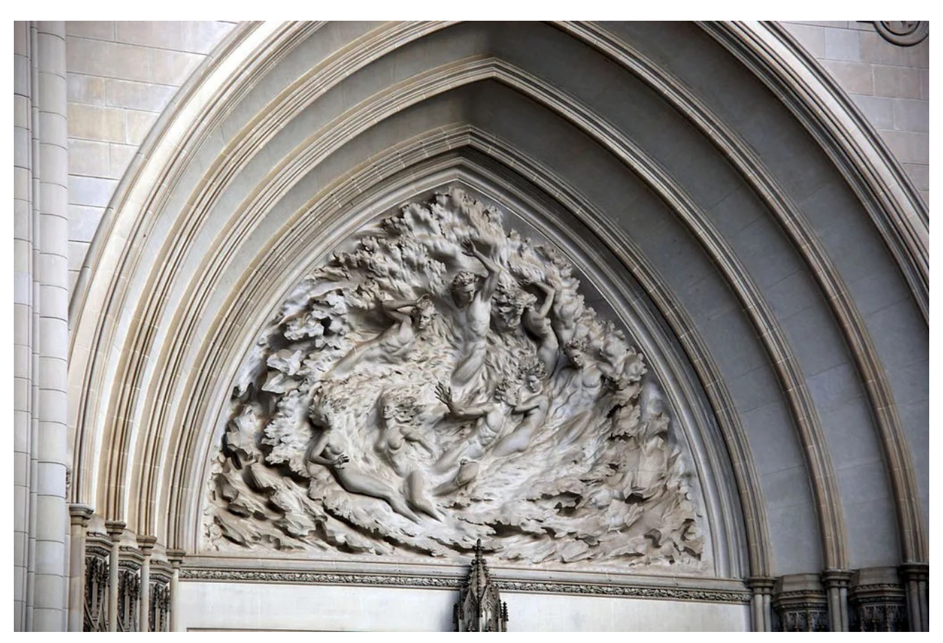
The Creation of Humankind, by Frederick Hart, Washington National Cathedral