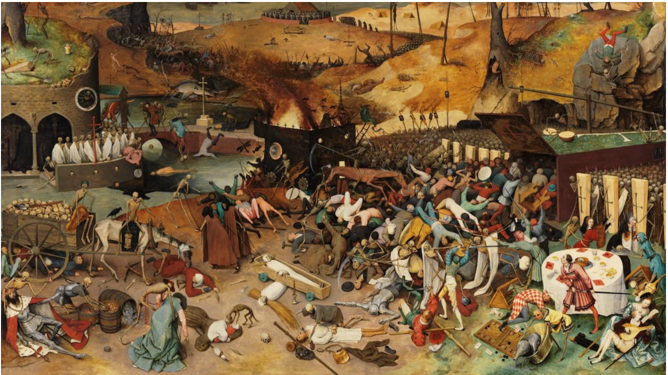
Pieter Bruegel the Elder, Triumph of the Black Death (c.1562), Madrid, Museo del Prado