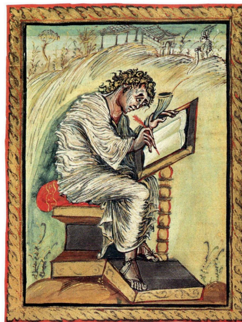
Interpretation of a classical scholar as a scribe or an evangelist in the Ebbo Gospels (816-835).