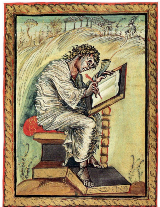
Interpretation of a classical scholar as a scribe or an evangelist in the Ebbo Gospels (816-35).