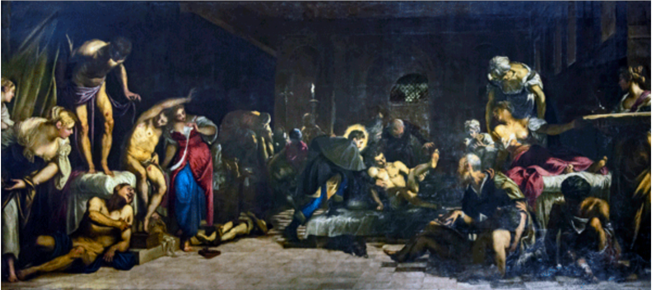
Tintoretto, St. Roch Healing Victims of the Plague , oil on canvas, 10' x 22', 1559, Church of San Rocco, Venice (Italy).