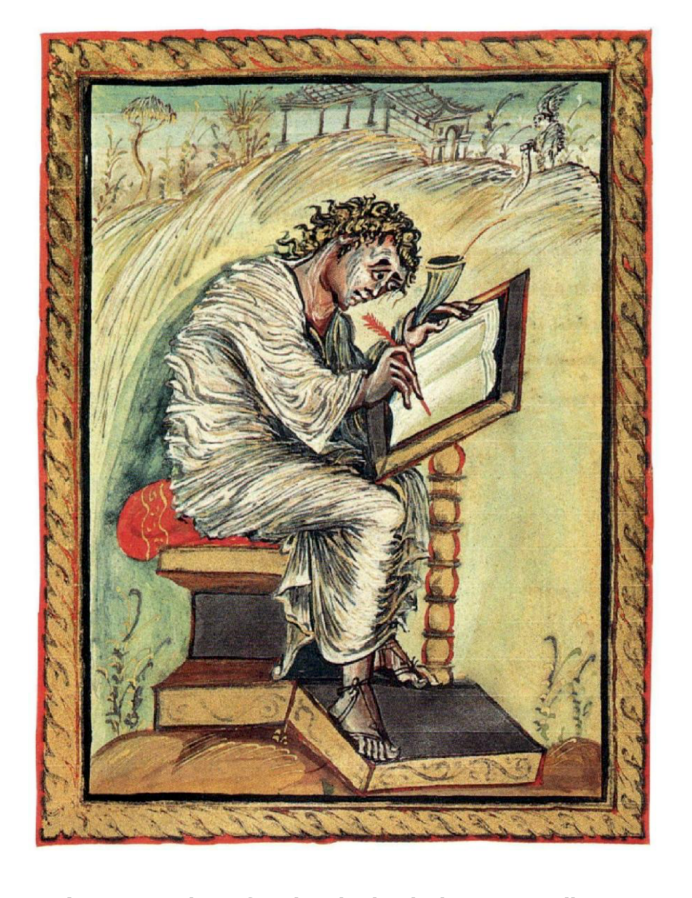
Interpretation of a classical scholar as a scribe or an evangelist in the Ebbo Gospels (816-35).

The supposition is that two issues each year will cover what needs to be covered.